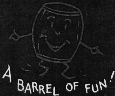
A BARREL OF FUN!